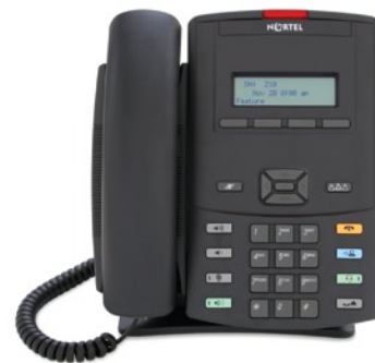
Nortel IP Phone 1210