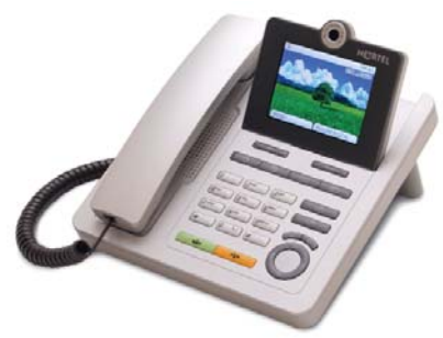
Nortel IP Phone 1535

The IP Phone 1535 is ideal for environments where a desktop or laptop PC may not be available or suitable, yet IP telephony and video conferencing is desired. The IP Phone 1535 may also provide benefit to users requiring a simplified always-on operation, flexible deployment with Wi-Fi connectivity, and casual web browsing or e-mail access.